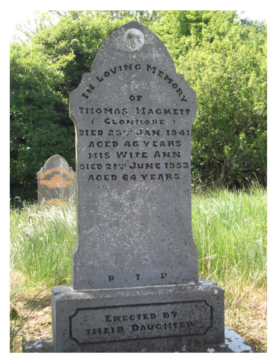
(Headstone altered after photograph was taken)